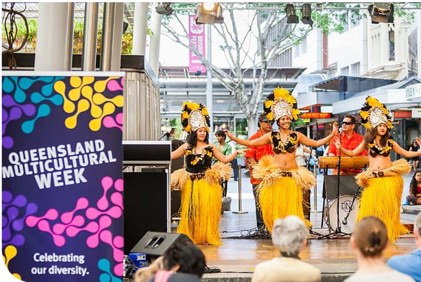
Queensland Multicultural Week launch.