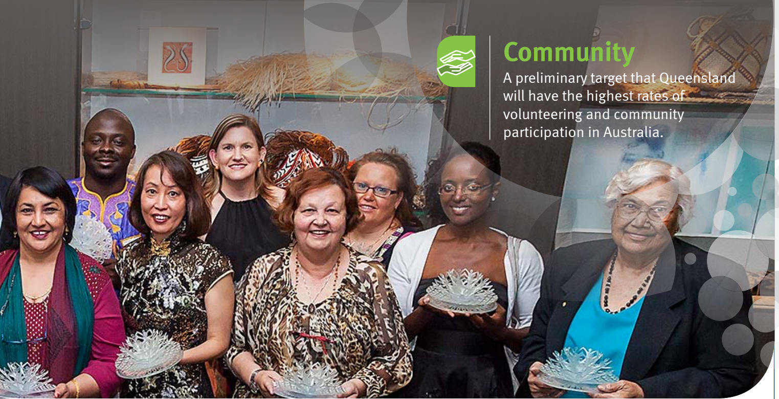
Queensland Multicultural Awards 2013

A preliminary target that Queensland will have the highest rates of volunteering and community participation in Australia.